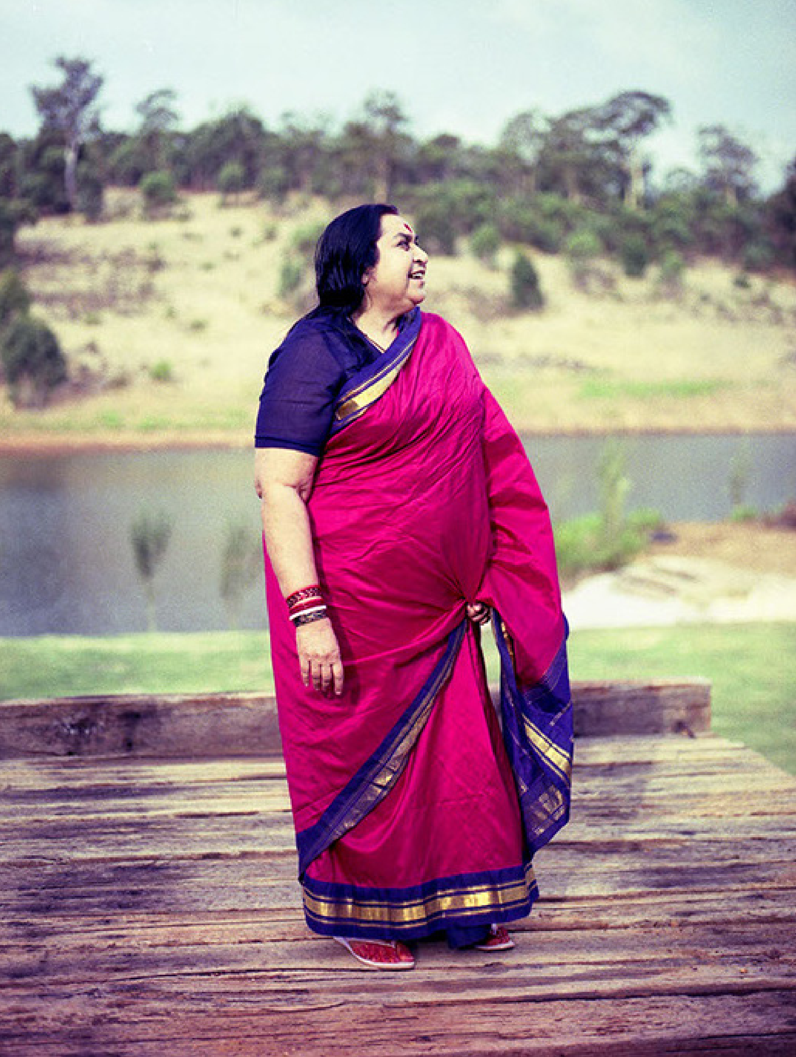
HH Shri Mataji at Gidgegannup in Western Australia