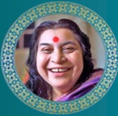
HH SHRI MATAJI NIRMALA DEVI