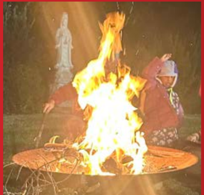
Images in the Havan Fire at Easter Puja - Bamoral - 18-5-2025