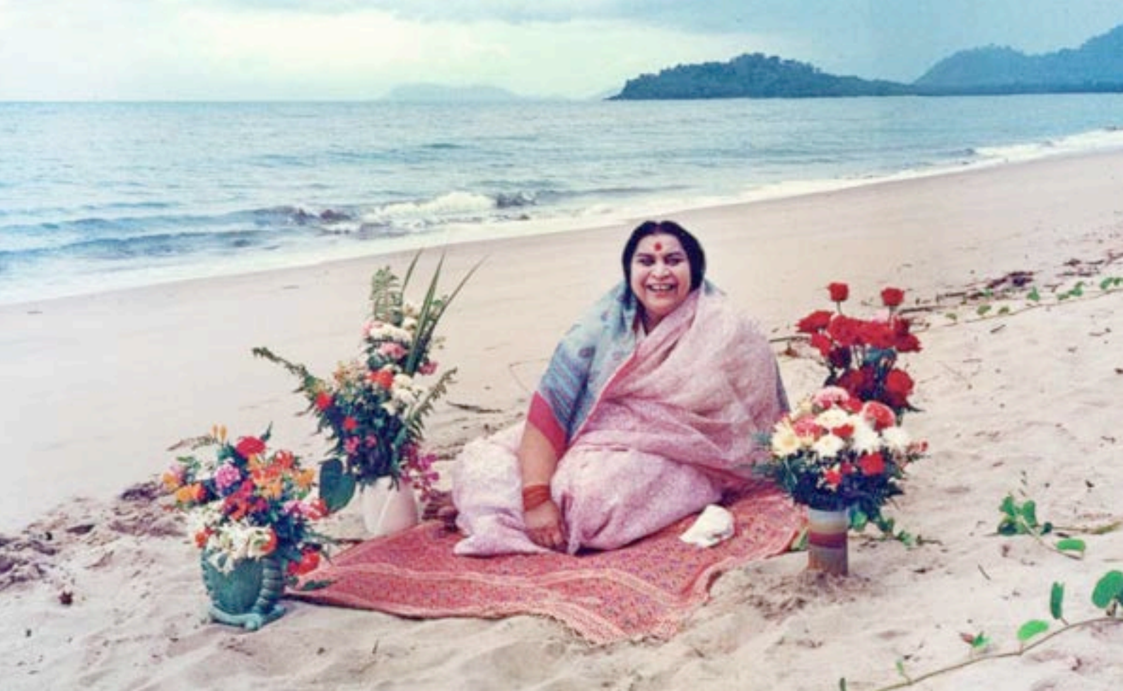
HH Shri Mataji visits Cairns and Wamuran