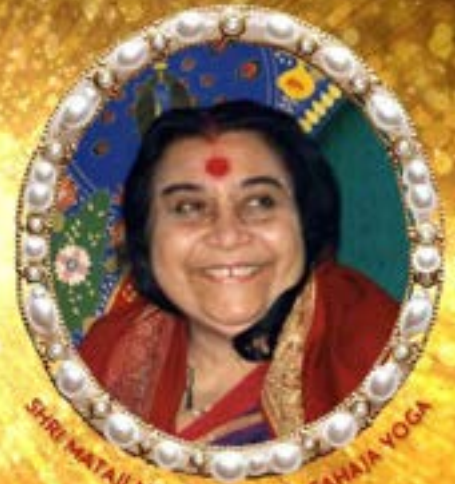
SHRI MATAJI NIRMALA DEVI • SAHAJA YOGA