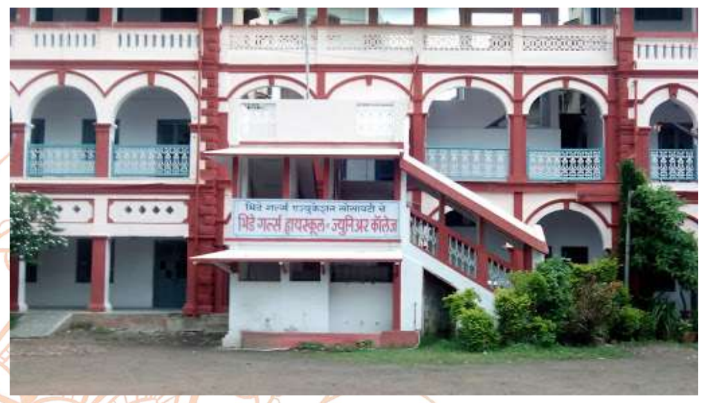
Shri Mataji's Childhood School (Bhide Girls High School)

It is located in the area Sitabuldi of Nagpur, were established in 1878.