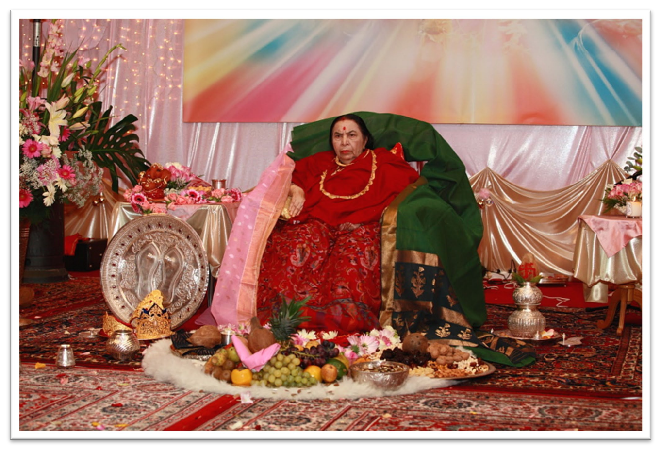
HH Shri Mataji Nirmala Devi Diwali Puja Cabella 18th October 2009

Specific to Sahaja Yoga, is the integration that it brings between various faiths, mythologies and religions; the thread that is binding them all in such a beautiful and natural way becomes visible and can be even experienced by those that speak and understand the language of the vibratory awareness.