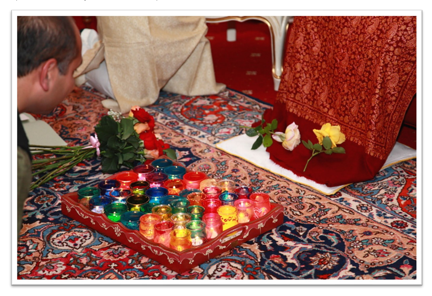
HH Shri Mataji Nirmala Devi Diwali Puja Cabella 18th October 2009

It's a great enjoyment with that, when the lights are burning, it's to give you happiness; they are burning their bodies to give you happiness. They are the ones who should teach us that we have to do something ourselves to enjoy our own higher awareness. ...Now as it is, what is the aim after all, what is the aim of our lives? We have to change the whole world into a peaceful theme. Changing yourself, of course, is great thing, no doubt; but changing others also will stop all the problems of the world. If all the people of this world become good people, then can you imagine what will happen?" (HH Shri Mataji Nirmala Devi)