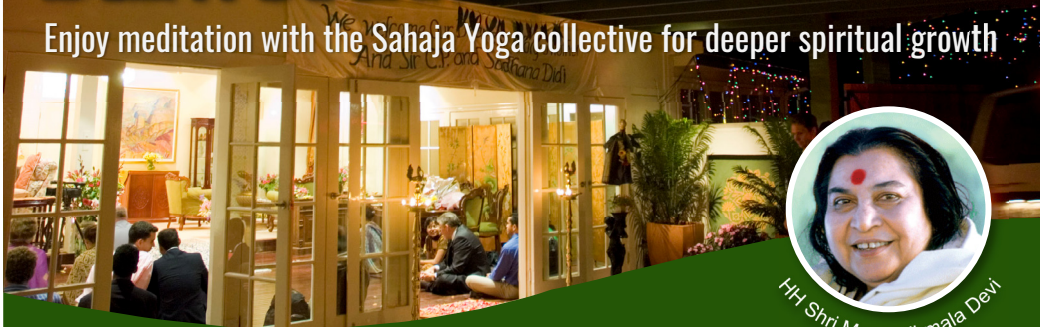
HH Shri Mataji Nirmala Devi

Enjoy meditation with the Sahaja Yoga collective for deeper spiritual growth